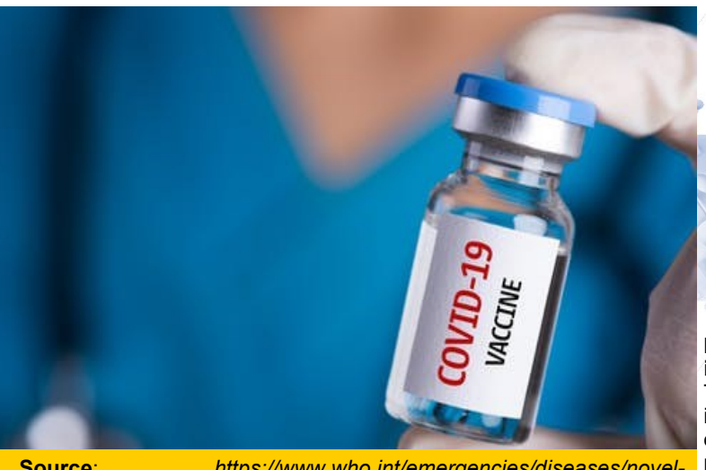
Source : https://www.who.int/emergencies/diseases/novel-coronavirus-2019/covid-19-vaccines/advice

he world is in the midst of a COVID-19 pandemic. The World Heath Organization (WHO) and partners work together on the response -- tracking the pandemic, advising on critical interventions, distributing vital medical supplies to those in need--- they are racing to develop and deploy safe and effective vaccines.